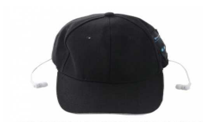
The product integrates the fashionable Sun-bonnet and Bluetooth Hoadset which is equipped with built-in speaker and microphone, supports hands-free function.